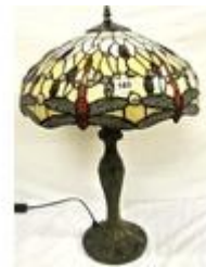
183. Art Deco style electric table lamp with multi-coloured panelled shade, baluster shaped column, on circular base