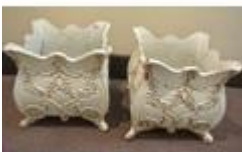
176. Pair of cast iron garden planters with wavy rims and foliate decoration