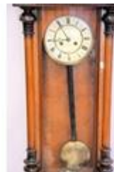
185. Edwardian mahogany Vienna wall clock with shell decorated frieze, turned finials, circular brass double enamel dial, brass pendulum