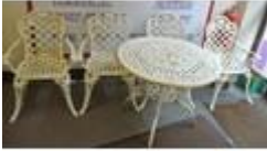
175. Cast iron five piece garden or patio suite - circular table and four open arm-chairs with bows and beehive decoration