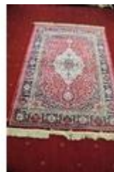
186. Red ground cashmere rug with floral medallion design