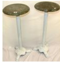
181. Pair of circular marble topped jardiniere stands with decorated cast iron tripods