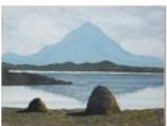
262. Gerry Dillon 'Errigal mountain, Donegal' watercol- our 24x28cm signed