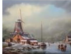
267. Continental school 'Winter canalside scene' oil on canvas 40x50cm signed