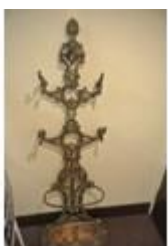
180. Victorian style cast iron hallstand with ornate scroll decoration and shaped hangers