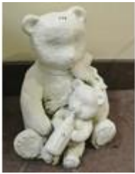
174. Stone garden statue of two teddy bears