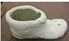
178. Stone boot shaped garden planter