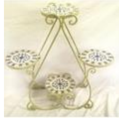
182. Four tier wrought iron plantstand with circular foliate decorated trays