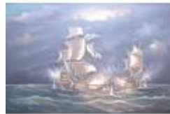
266. Maritime school 'Naval engagement' oil on canvas 60x90cm