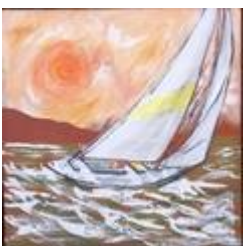
261. Reynolds 'One de- sign under sail' oil on canvas 102x102cm signed