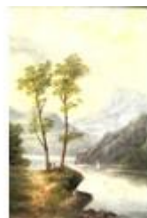
270. Irish school 'River- side study' oil on canvas 40x30cm signed