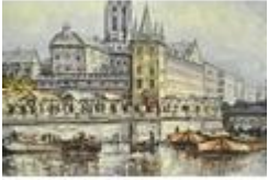
256. Continental School 'Riverside street scene' oil on canvas 60x90cm