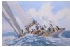
265. Ken Hayes 'Sailing offshore' watercol- our 33x50cm signed