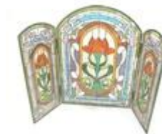
184. Art Deco style domed triple fire-guard with multi-coloured panels