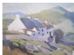
271. John Skelton 'White washed cot- tages' print 36x50cm