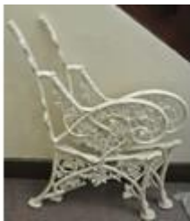
177. Pair of ornate Coalbrookdale style cast iron garden bench ends with leaf and foliate decoration