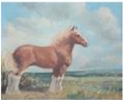
258. Irish school 'Con- nemara pony' oil on board 24x29cm signed