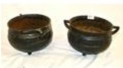
179. Pair of cast iron garden skillet pots with shaped handles