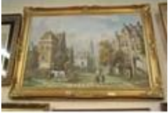
257. K Rothman 'Street scene with figures' oil on canvas 60x90cm signed