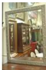
187. Edwardian design bevelled glass wall mirror in ornate foliate decorated frame 115x90cm