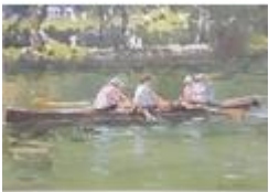
260. Ken Hayes 'Rowing on a river' watercol- our 25x35cm signed