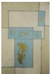
263. Ben Catt 'Light- house' oil on canvas 140x80cm mono- grammed